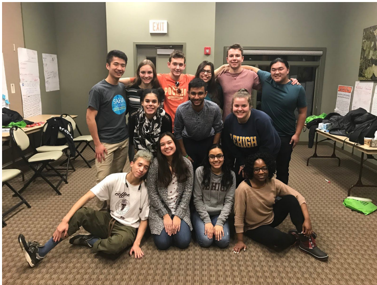
My LeaderShape Cluster Family