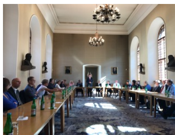
Prague, Charles University, July 2017