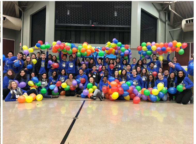
2018 LeaderShape Cohort