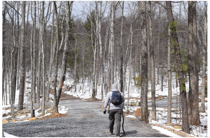
Hike on Big House Mountain (VA)