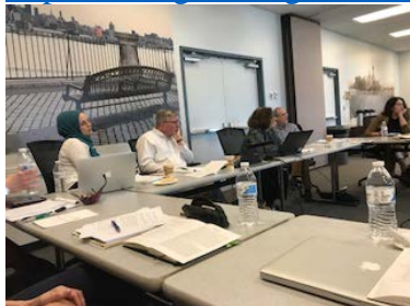
April 13 at Lehigh

https://dialogue.lehigh.edu/sites/dialogue.lehigh.edu/files/IAMEPH%20Program.pdf