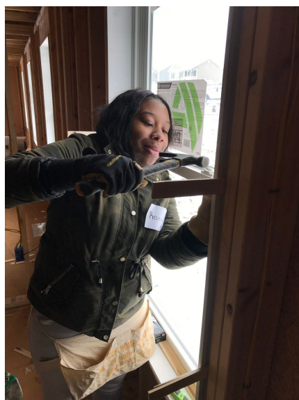
Securing New Windows