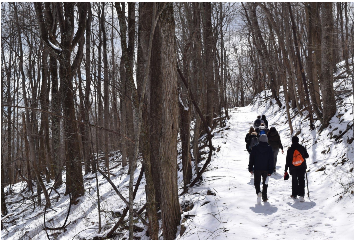
Hike on Big House Mountain (VA)