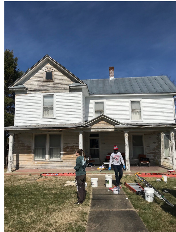
Home Restoration After