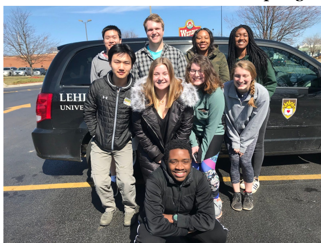
Day of Departure