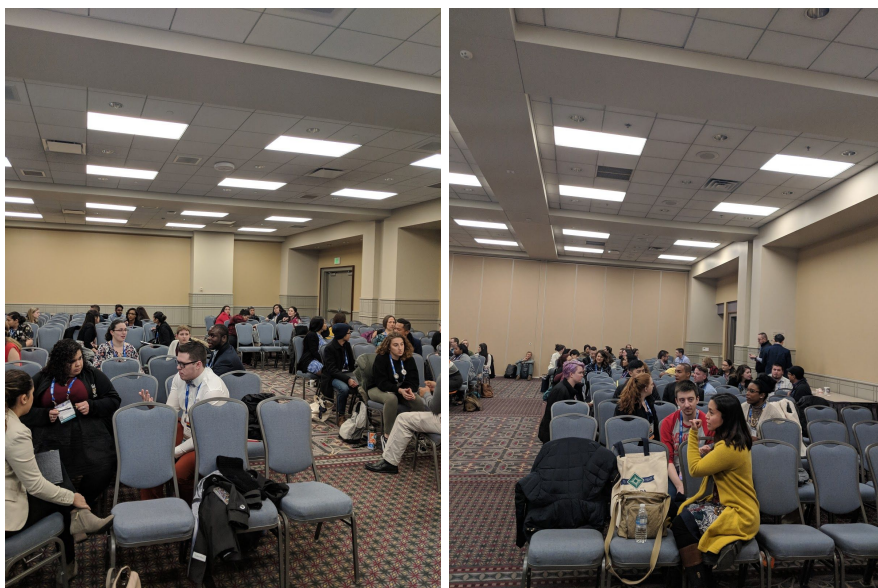
selected shots of the audience for our workshops

Feedback: We continued to receive highly positive feedback for both our workshops, as well as ample praise for the great work happening at Lehigh. Perhaps one of the most impactful demonstrators of our success has been the number of individuals who have reached out to me to have conversations as a follow-up to our LUally session specifically. As a result of presenting our work at both the NASPA Multicultural Institute and NASPA’s Annual Conference, it is clear that Lehigh is being established as a leader in the area of LGBTQ+ allyship engagement.