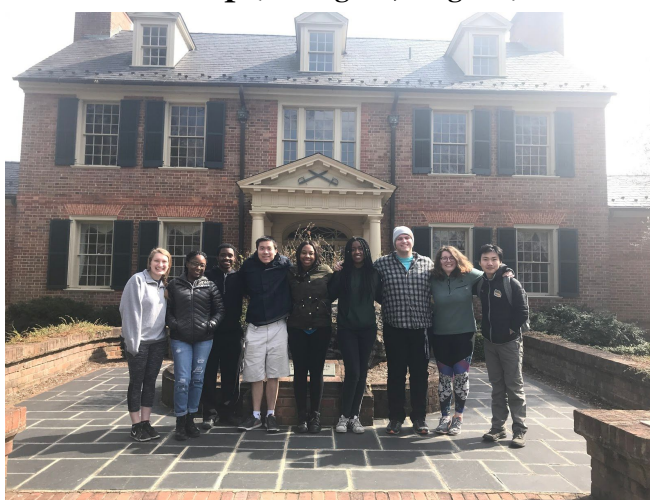
Sigma Nu Fraternity Headquarters