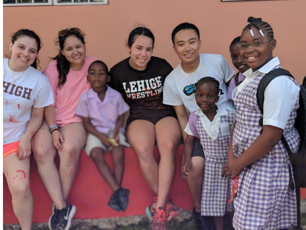
Schoolchildren from New Winthorpe's School with donations | Lehigh students with children after painting a school