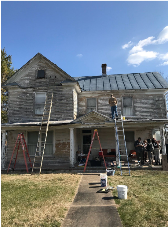
Home Restoration Before