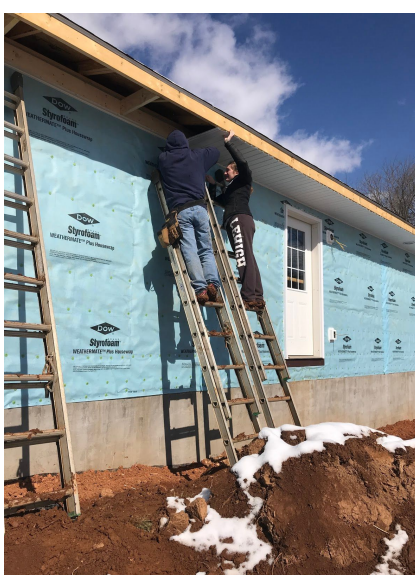
Installing Drip Edges